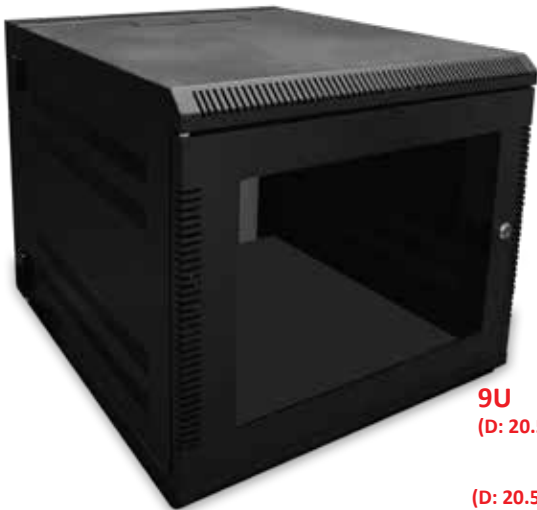
9U (D: 20.5" X 23.2" X 19.0")